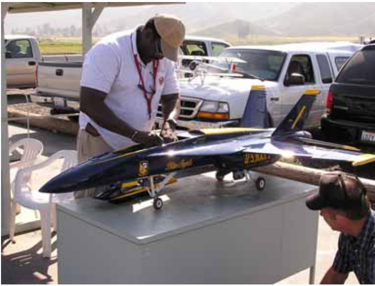
HMM Member performing a Post flight Inspection. His brakes failed on landing. Glad it was only minor damage.