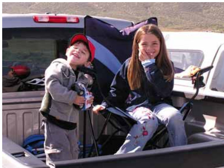
Spectators enjoying a beautiful morning of flying