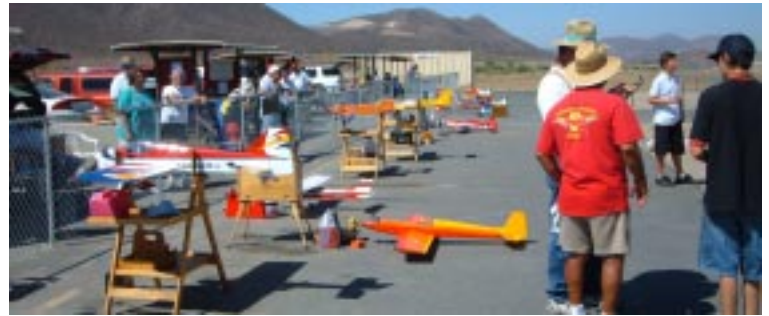
Beautiful Day for Flying