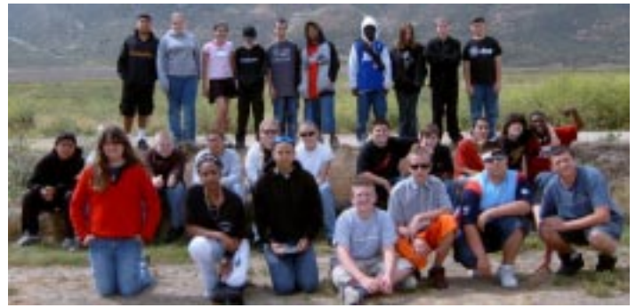
Group Photo of all the students from Santa Fe Middle School who participated in the event.